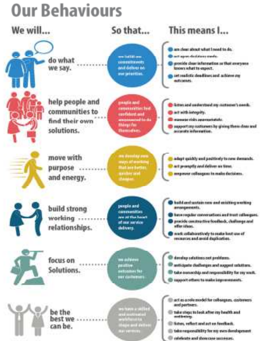
Figure 2 Warwickshire's Six Key Behaviours

As part of our governance framework we apply six key behaviours which provide a clear framework on the behaviours we should be demonstrating on a day to day basis to support the cultural change and transformation of the organisation. The behaviours are integral to 1:1s and appraisal conversations as well as key to the way we recruit and develop our colleagues. http://www.warwickshire.gov.uk/ourbehaviours