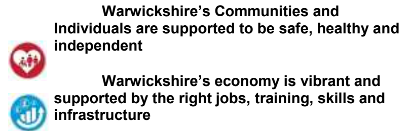
Figure 3 WCC's Core Purpose and Key Outcomes (OOP-2020)

Our core purpose: 'We want to make Warwickshire the best it can be' . This is supported by outcomes which will form the focus of our work moving forward: